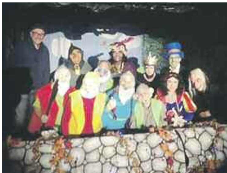
Last Halloween's Moraga garage skit was "Snow White."

It's time once again for a local October tradition – the annual Halloween skit in Moraga. This year's